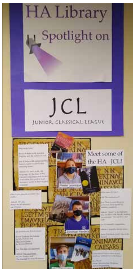
Junior Classical League