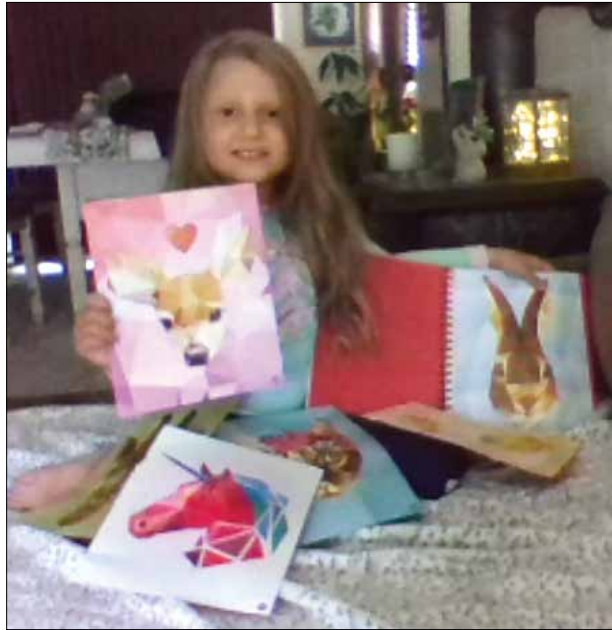
One student created images using her "Sticker by Number" book. She said the images look like stained glass.

perience for over 100 students. The four week program was run through Google Classroom. Weekly assignments were posted every Monday, starting on July 11th. Each weeks' assignments were due by the following Sunday. Students earned points toward the Virtual