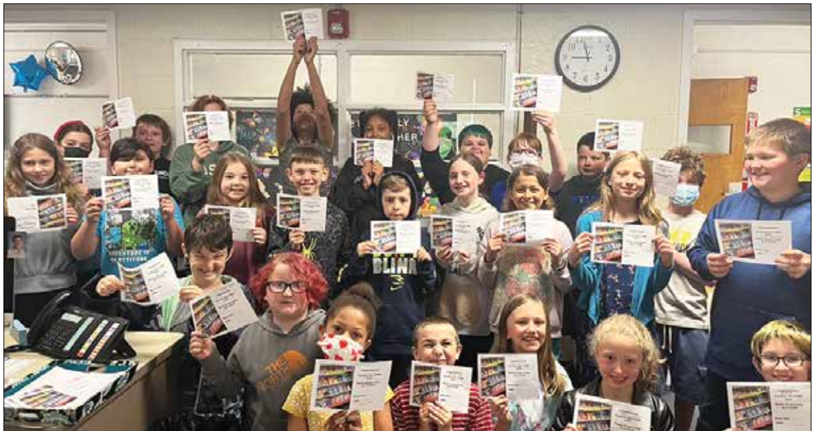
Excited Bobcats who were raffle winners of the PTO Spring Book Raffle!