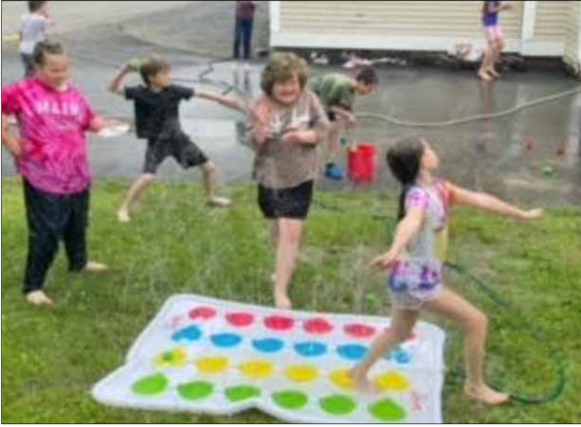
Students celebrated with a water party!