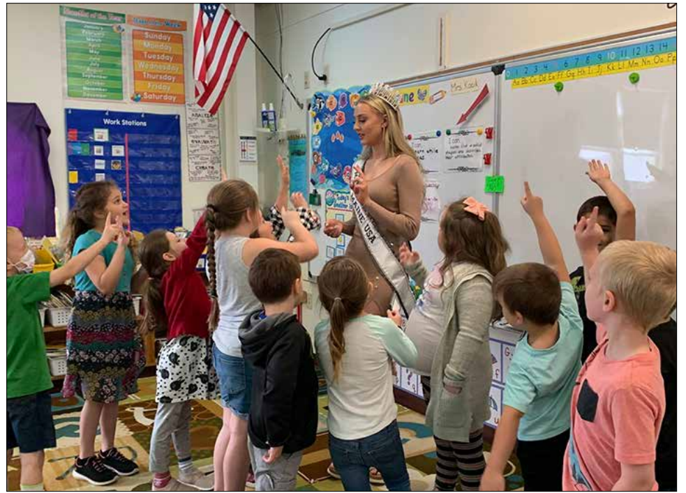
Miss Maine visited classrooms to talk about the importance of education.