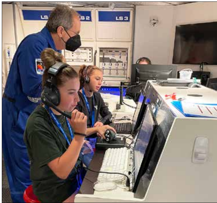
CHALLENGER LEARNING CENTER —The entire Wagner Middle School 7th grade attended the Challenger Learning Center in June. They performed a series of successful missions as a team, despite a two year Covid delay.