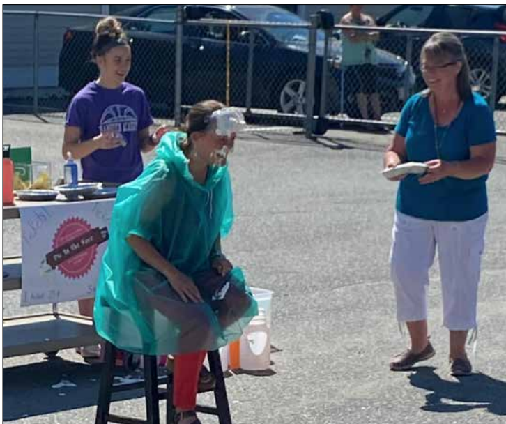
PIE in the Face