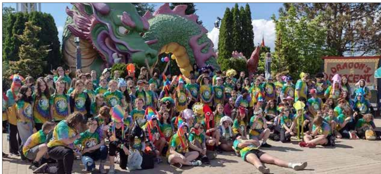
Above: 7th and 8th graders in the Wagner and Reeds Brook band and chorus enjoyed an end of year field trip to Fun Town Splash Town.