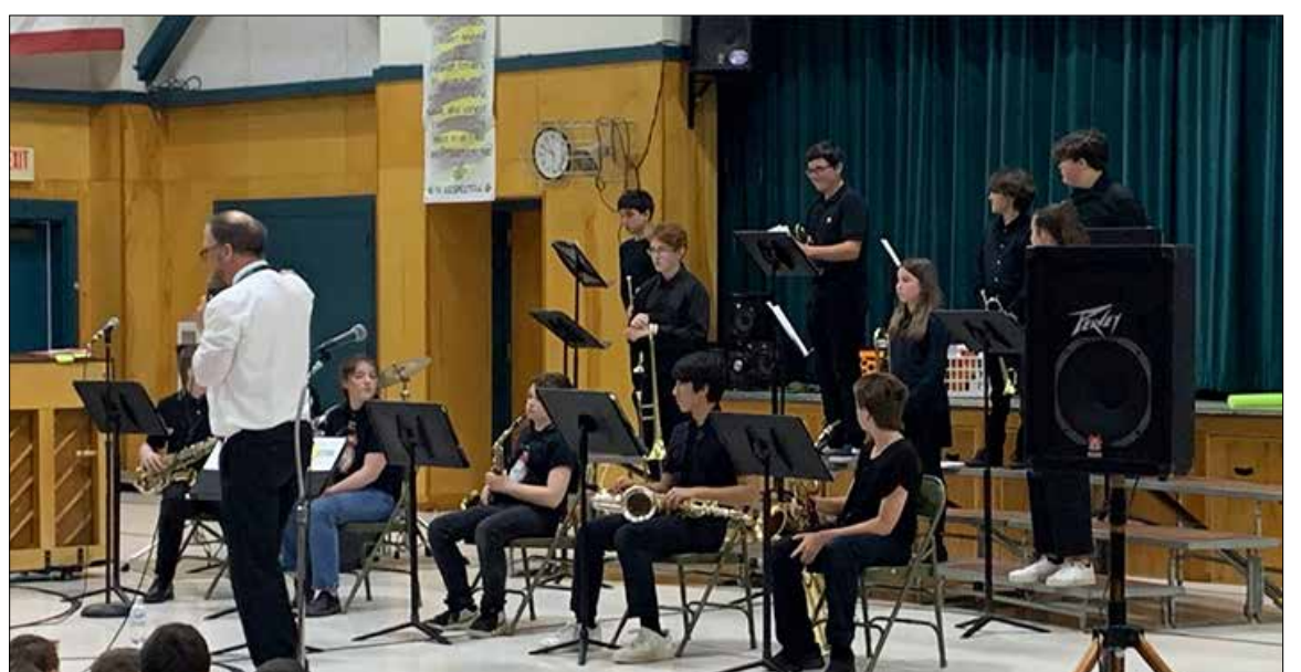
The Wagner band and chorus visited Smith, offering an amazing performance.