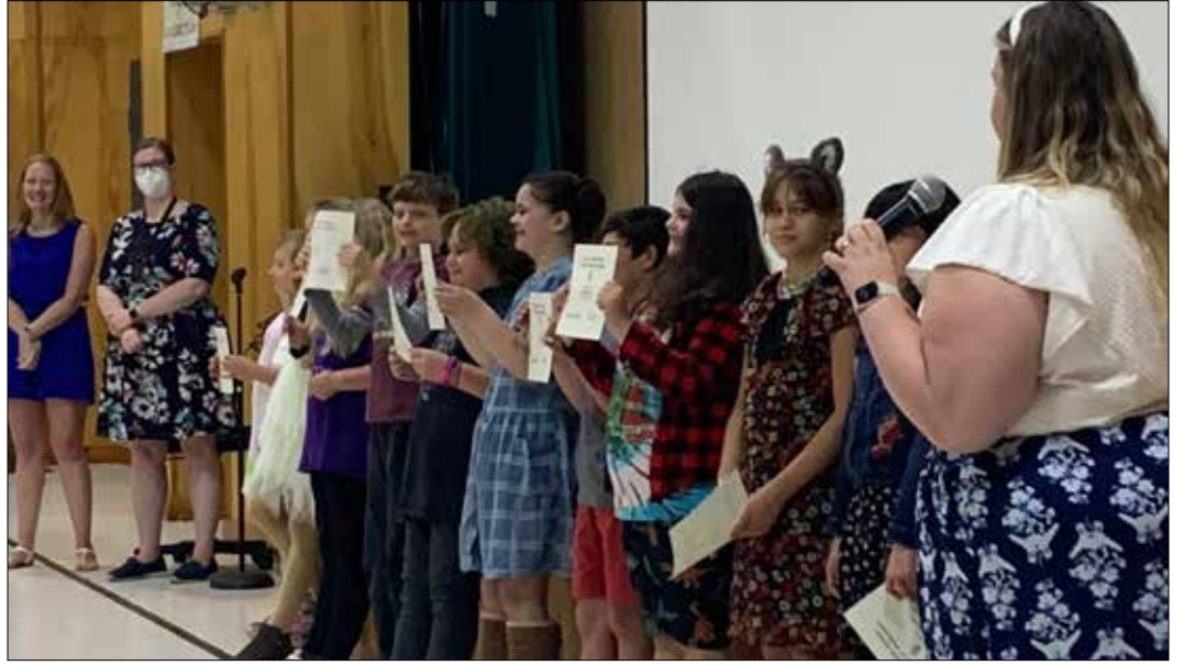
Fourth grade had a wonderful celebration to wrap up their time at Smith School.