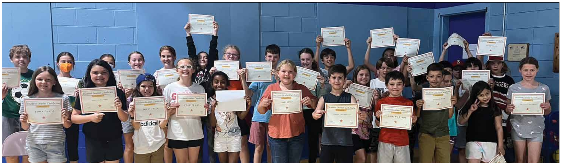
Weatherbee Student Leaders—Student Leaders were recognized in an all school assembly for their work this year. Some projects included Maine Day, the staff vs. students basketball game and supporting school wide efforts around appropriate behavior.