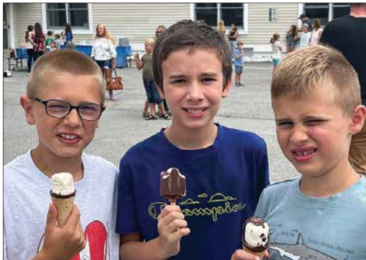
Students who completed VSS celebrated with an ice cream social Aug. 10 at Smith School.