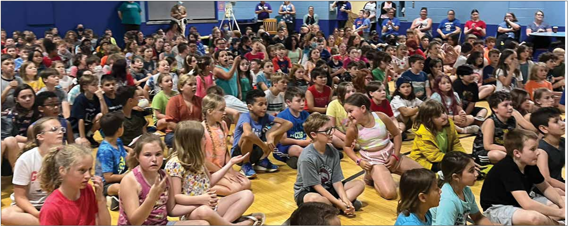
Better together! Our first whole school assembly since we went into lockdown. Students were able to sing our school song together for the first time.